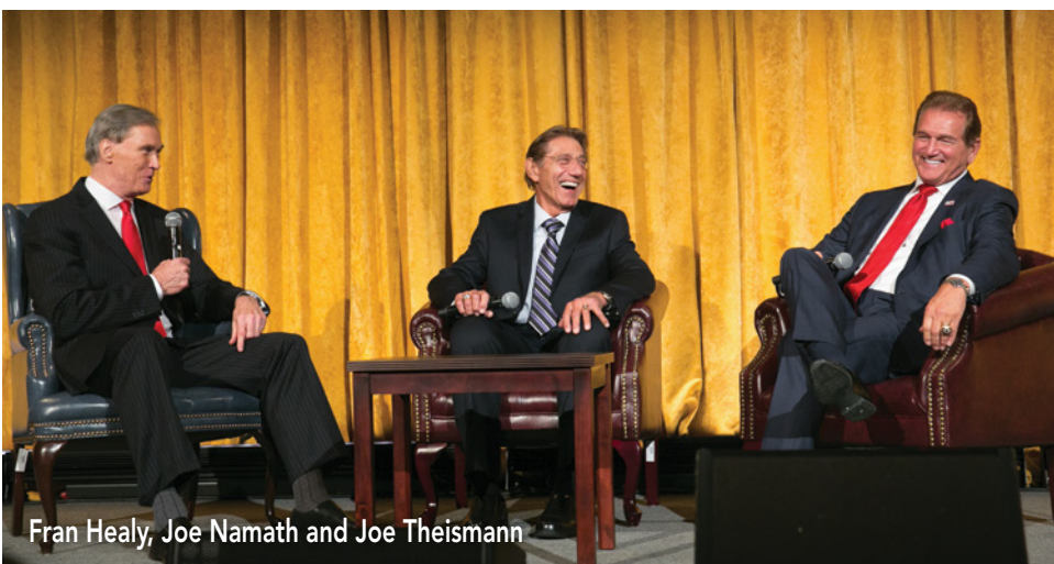
Fran Healy, Joe Namath and Joe Theismann

To support the ongoing efforts surrounding TBI research, visit namathneurocenter.org or call 800-864-2234.