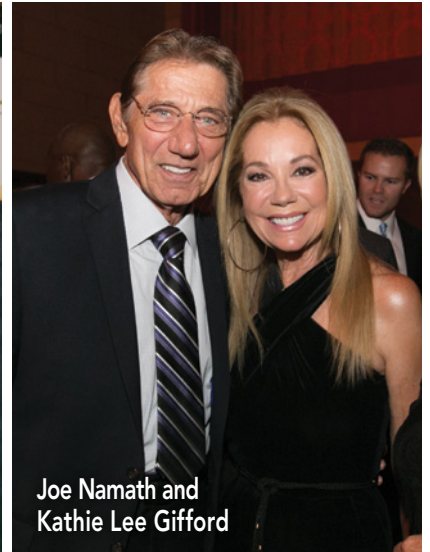
Joe Namath and Kathie Lee Gifford